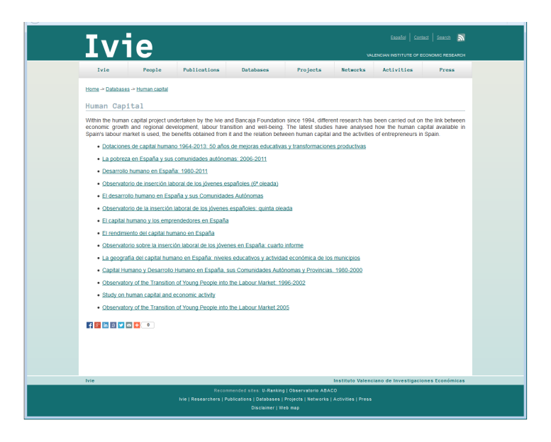
Figure 2: List of the studies available on the web page

communities level. This extensive database, which the Bancaja Foundation and the Ivie have made available to the public, is accompanied by various studies examining the link between human capital and economic growth, regional development, labor market issues and well-being, and also by a number of Human Capital Notes, which summarize the main results obtained in the project<sup>2</sup>. The next database release, which will cover up to 2015, is expected to be published by the second half of 2015.