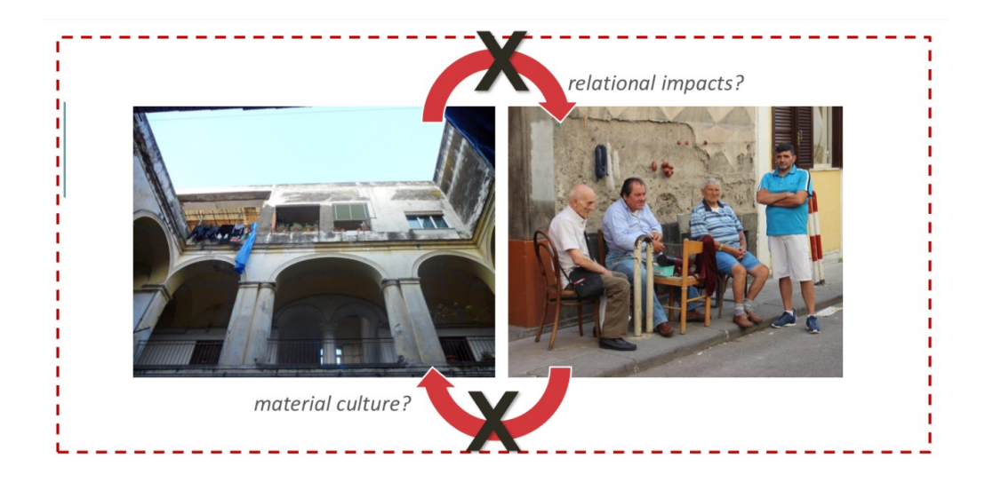
Figure 7: Buit environment and local community decay in Torre Annunziata

UK, France, Spain, Germany, Austria, Greece, Emirates, Japan, Australia.