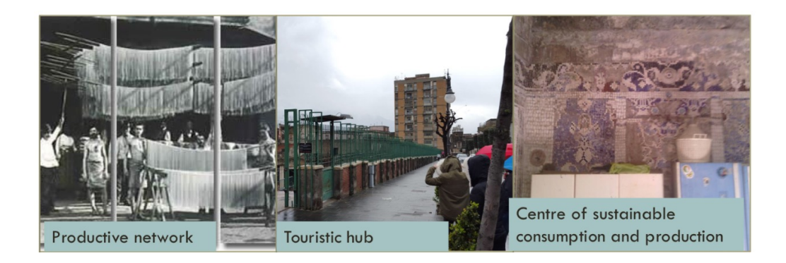
Figure 8: The contribution of art in the proposed scenarios of development

it contributes to develop integrated economic activity and to improve the relationships of tourists and local people. This scenario relates traditional pasta production to the proximity of archeological sites of Villa di Oplonti and Pompeii ruins. Art is intended as daily, permanent opera, produced locally and site-specific. It is mainly for residents though it is a source of attraction for tourists. This kind of art, called social art, is supported by new types of economy as collaborative and sharing economy and is an aid for facing new urban challenges, which are evident in Torre Annunziata. In the third scenario, art is instrumental in adding economic/cultural values and in engaging people, sharing knowledge, connecting people, designing urban recovery, finding the strength for change. It produces social crossovers as it causes the regeneration of relations and inter-relations between people and built environment. The third scenario seems to be the best solution in order to improve the quality of landscape and activate a new development, driven by the reactivation of local communities and the recovery of their ability to relate to natural and built environment.